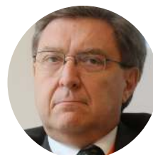
Enrico Giovannini, Full Professor and Director, Alleanza Italiana per lo Sviluppo Sostenibile

Thanks to your work, many more companies, associations, civil society organizations and people know what they didn't know: they are wasting a lot of food, energy, water and many other things.